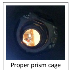
Proper prism cage