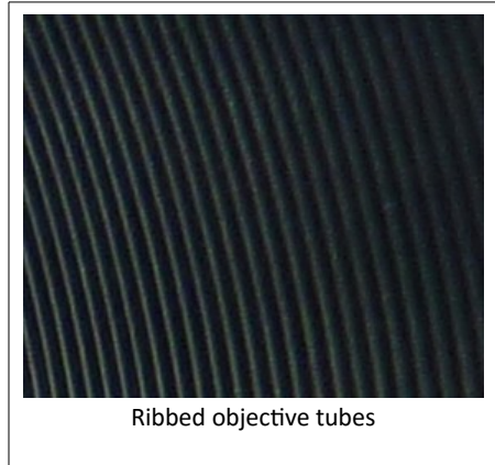
Ribbed objective tubes

The binocular is also provided with a very substantial metal post-type tripod adaptor that clamps to the mounting bar, where it is secured with two knurled thumb-screws. These are just large enough to be operated with thin-to-medium gloves, but not with thick ones. The bottom of the post is threaded with \frac{3}{8} -inch Whitworth mounting hole. A \frac{1}{4} -inch adaptor is thoughtfully included, so that the mounting post will mate with a variety of mounting options.