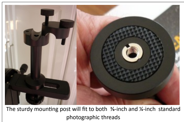
The sturdy mounting post will fit to both \frac{3}{8} -inch and \frac{1}{4} -inch standard photographic threads

The binocular is also provided with a very substantial metal post-type tripod adaptor that clamps to the mounting bar, where it is secured with two knurled thumb-screws. These are just large enough to be operated with thin-to-medium gloves, but not with thick ones. The bottom of the post is threaded with \frac{3}{8} -inch Whitworth mounting hole. A \frac{1}{4} -inch adaptor is thoughtfully included, so that the mounting post will mate with a variety of mounting options.