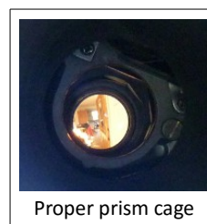
Proper prism cage